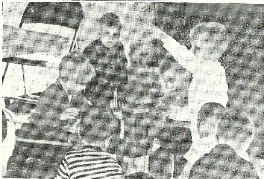
Today's Kindergarteners, Tomorrow's Engineers